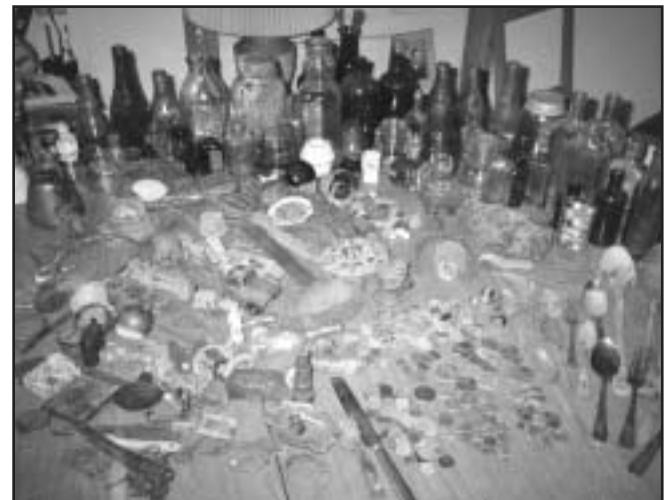
A vast collection of valuable articles found with a Garrett GTI 2500.