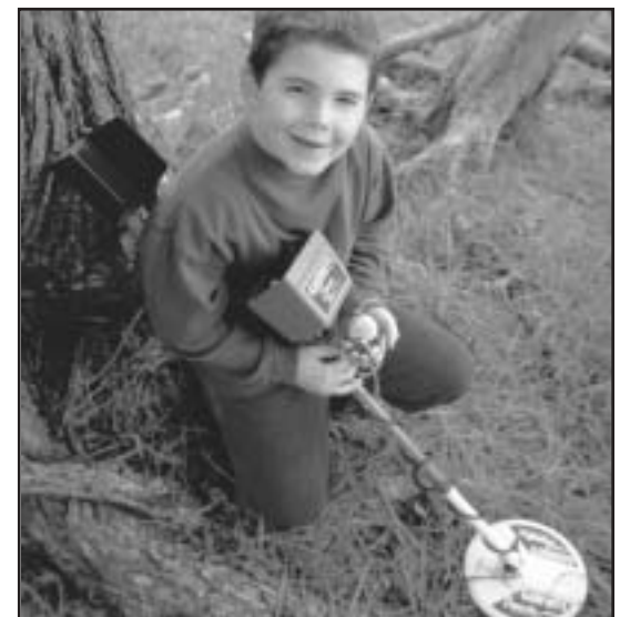
It's never too soon to begin the exciting hobby of metal detecting.

“Thank you for giving me a quality product that ensures quality time alone or with my children..”