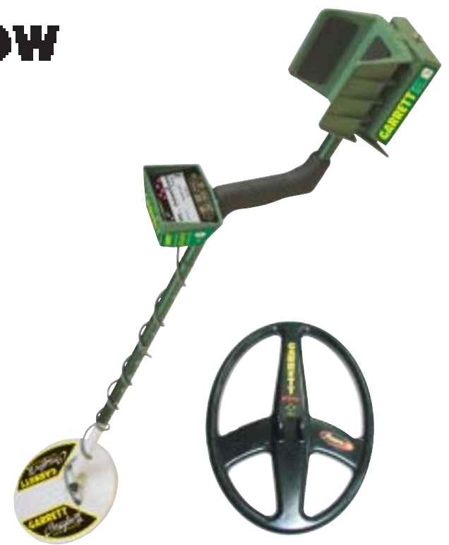
A winning combination; the Garrett GTAx 1250 with the new Power DD searchcoil.

Hobbyists can seek out all metal objects with the Treasure Ace 300 or use its full range discrimination to hunt for specific targets. Garrett's patented Treasure Eye always offers reliable pinpointing. The Treasure Ace 300, plus the headphones, digging kit and book, is offered at only $299.95, a savings of $62.