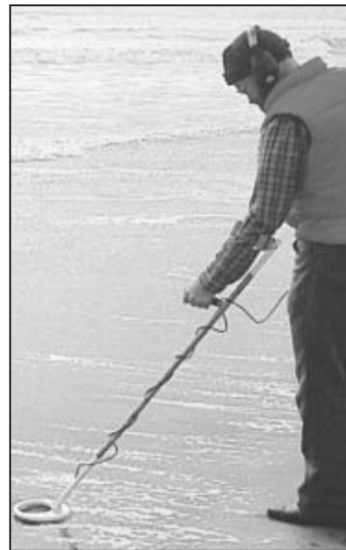
Find more treasure on the beach, in the surf, and at ocean depths with Garrett.

In addition to penetrating mineralized soil that might baffle standard coils, the Garrett Power DD will hunt deeper. And, its 10 x 14-inch size lets the treasure hunter use time more profitably by searching more area. The new coil's unique solid epoxy-filled open design gives it exceptional stability and matchless durability. Because it is fully submersible the new coil is an excellent choice for beach and surf hunting.