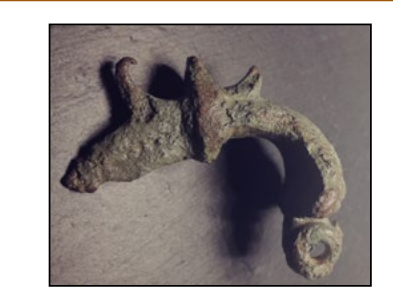
Finder:Jan O., EuropeUsing:EuroACEFind:Roman fibula brooch