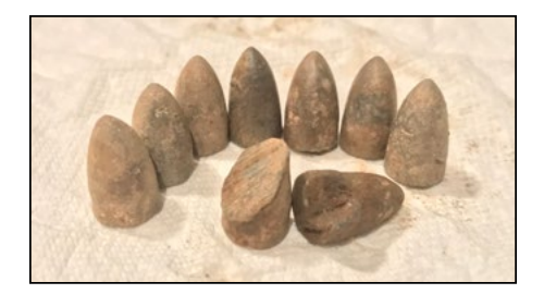
Finder: Randy G., Ohio Using: AT Pro Find: Nine Civil War picket bullets discovered with the AT Pro