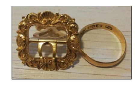
Finder: Using: AT Max International Find: 1736 gold buckle and a 1748 gold ring.