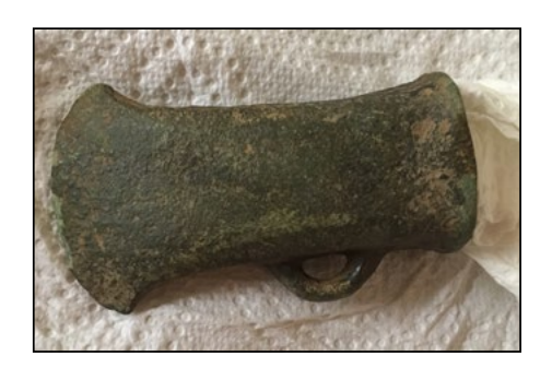
Finder:Dafydd M., EuropeUsing:ACE 400iFind:3500 year old Bronze Age axehead