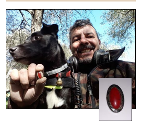
Finder: Tassano M., Europe Using: AT Pro International Find: Bronze medal encased with beautiful red gem, circa medieval times