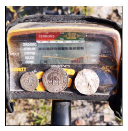
Finder: Mario M., Mexico Using: ACE 300i Find: Three silver reale coins