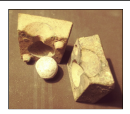
Finder:Joc T., EuropeUsing:ACE 400iFind:Musket ball mold