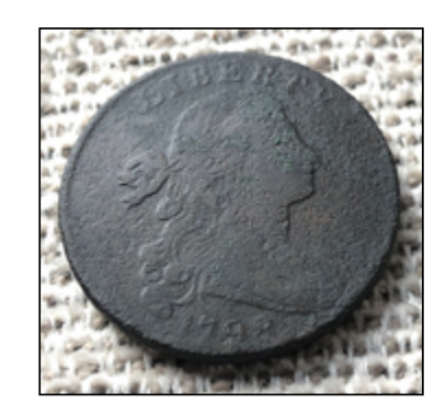
Finder: Nick P., New York Using: ACE 300 Find: 1798 Draped Bust large cent