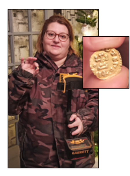
Finder:Angélique G., EuropeUsing:ACE 250Find:Merovingian gold coin