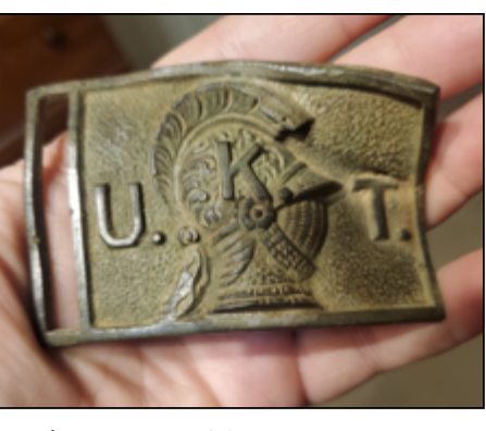
Finder:Kim C., TexasUsing:AT ProFind:U.K.T. brass buckle