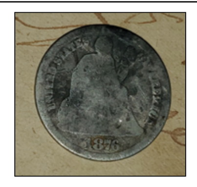
Finder: Brandon W., Alabama Using: AT Pro Find: 1876 Carson City Seated dime