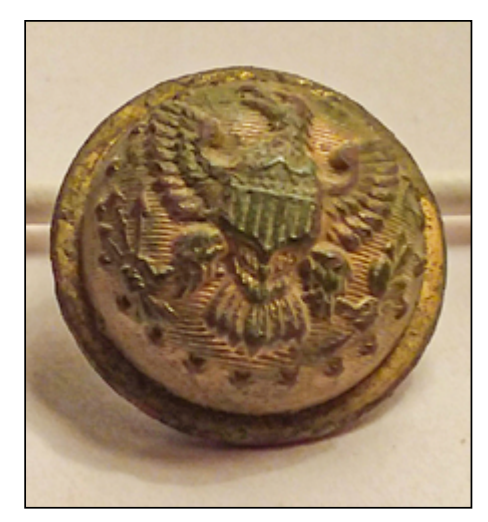
Finder: Janine D., Michigan Using: AT Pro Find: Civil War general staff button