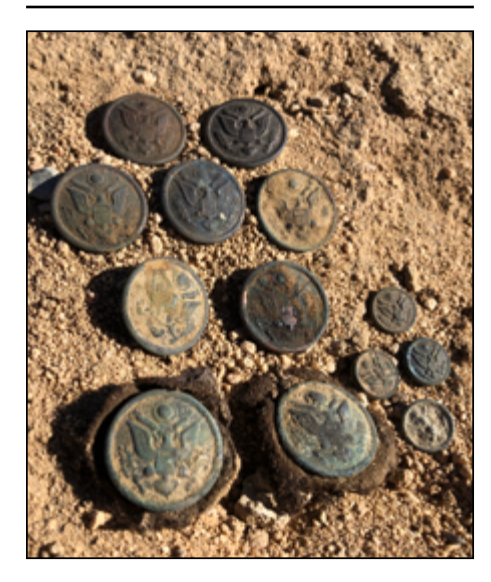
Finder:Brian F., CaliforniaUsing:AT ProFind:Twelve WWI coat buttons