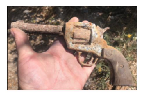
Finder: Robert G., Using: AT Pro Find: Savage model 101 hand gun, circa 1960s