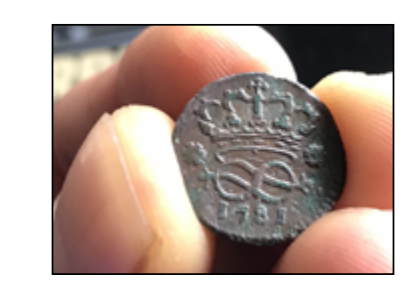
Finder: Gregorio P., Europe Using: EuroACE Find: 1781 Vittorio Amedeo 2 denari copper coin