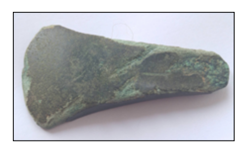
Finder: Cosnard, Europe Using: ACE 400i Find: Bronze votive ax, estimated to be 4,300 to 4,500 years old