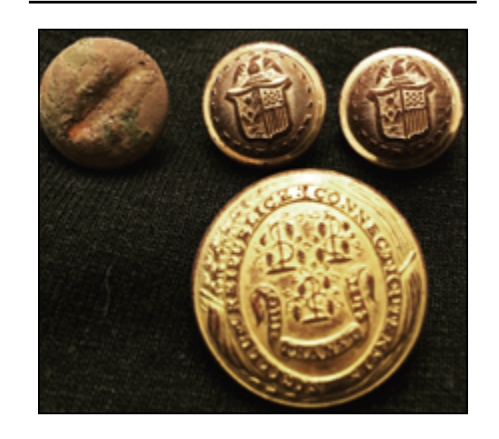
Finder: Brian W., Virginia Using: AT Pro Find: Four Civil War buttons: a general service, two New York cuff buttons, and a stunning Connecticut state seal button