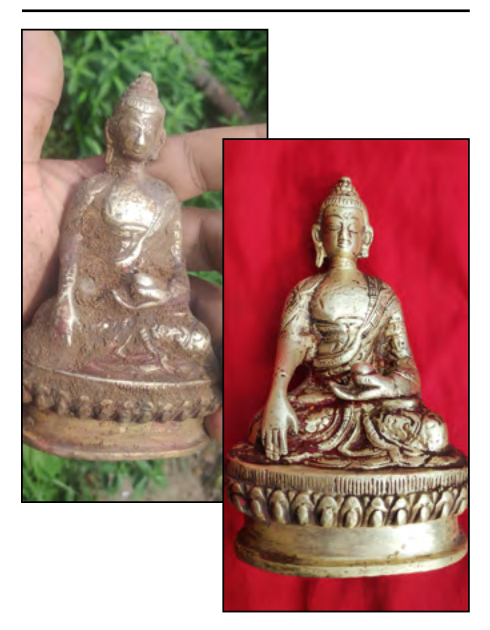
Finder: Subin S., Nepal Using: ACE 400 Find: Lord Buddha idol statue