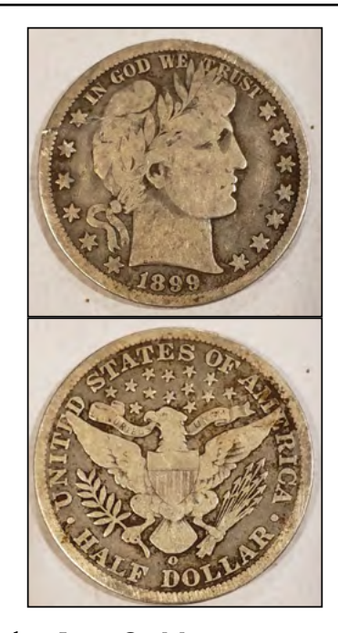
Finder: Jason O., Minnesota Using: AT Pro Find: 1899-O silver Barber half dollar