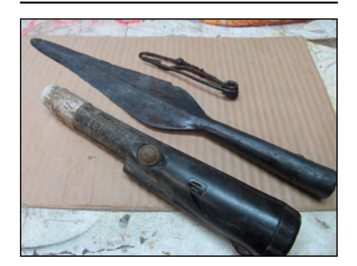
Finder:Miroslav S., EuropeUsing:AT ProFind:Roman spearhead and fibula