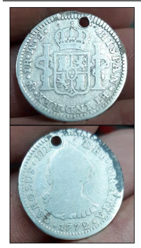
Finder:Johnny L., TennesseeUsing:ACE 250Find:1172 Spanish silver 1 reale