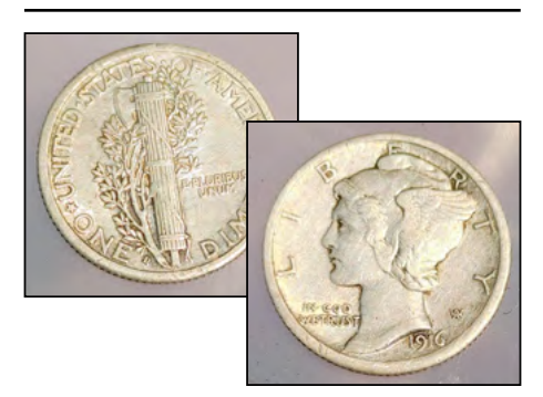
Finder:Jeffrey L., WisconsinUsing:AT MaxFind:1916-D silver Mercury dime