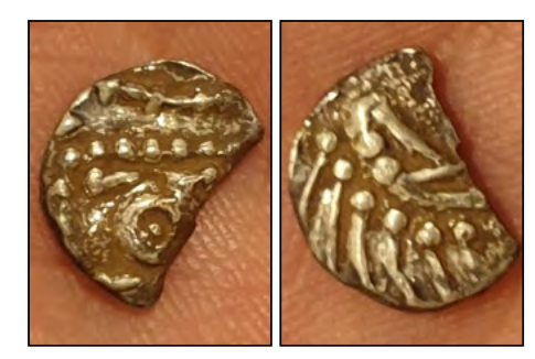
Finder:Terry T., EuropeUsing:ACE ApexFind:Silver Roman coin