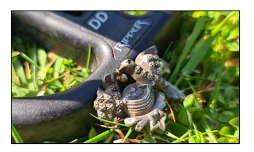
Finder:Ed P., EuropeUsing:ACE ApexFind:Silver love birds brooch