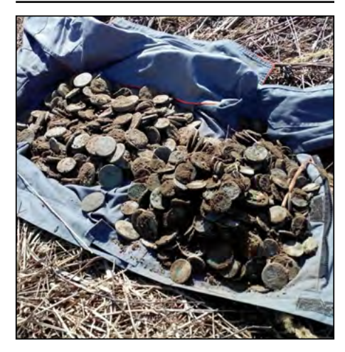
Finder: Leonid L., Europe Using: AT Pro International Find: Hoard of 900 Catherine II kopeck nickels