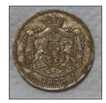
Finder: Betej G., Europe Using: ACE 150 Find: 1873 silver Romanian 1 leu coin