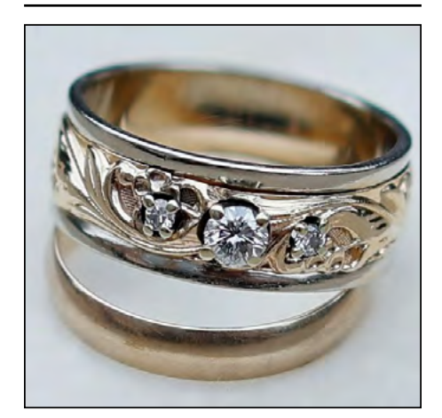
Finder: Brian L., Texas Using: ACE Apex Find: 1950s 14k vintage wedding band with three diamonds