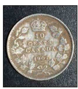
Finder: Ed T., Canada Using: AT Pro Find: 1907 silver Canadian dime