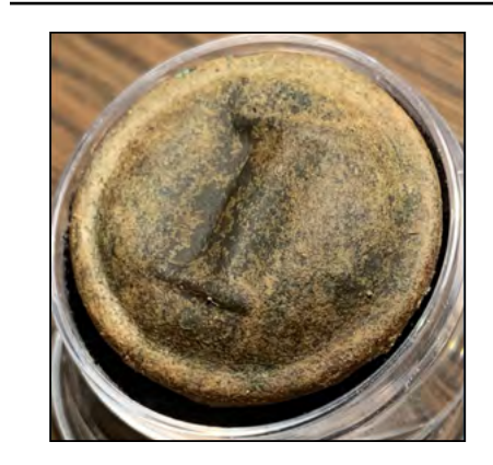
Finder:Shawn S., North CarolinaUsing:AT Max with Viper coilFind:Civil War Confederate Block Ibutton