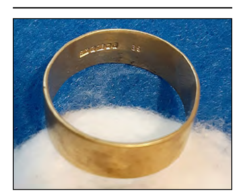
Finder: Thomas S., Nebraska Using: AT Max Find: 1905 18k gold ring from the United Kingdom