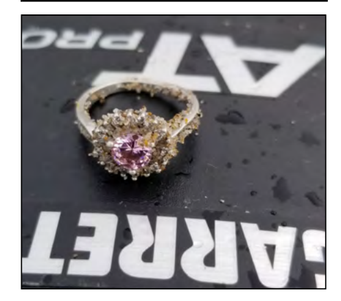
Finder: David A., New York Using: AT Pro Find: Beautiful ring recovered while searching the beach