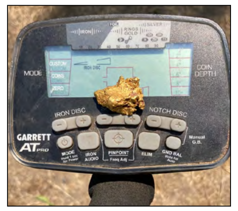
Finder: Bodhi W., Oregon Using: AT Pro Find: 14 gram gold nugget found near a stream bed