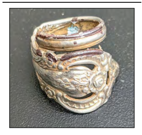
Finder:Fred N., GeorgiaUsing: GTP 1350 Find:Oneida spoon ring