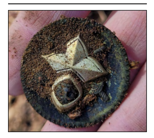
Finder:Jonathan H., New YorkUsing:ACE ApexFind:Early knight flat button