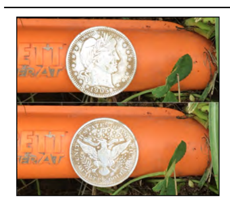
Finder: Ned C., Alabama Using: GTA x750 Find: 1905-O silver Barber quarter