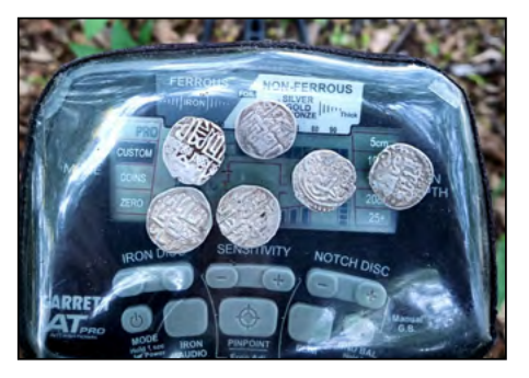
Finder: Mikhail D., Russia Using: AT Pro International Find: Six silver dirhams coins of the Golden Horde, circa 1350