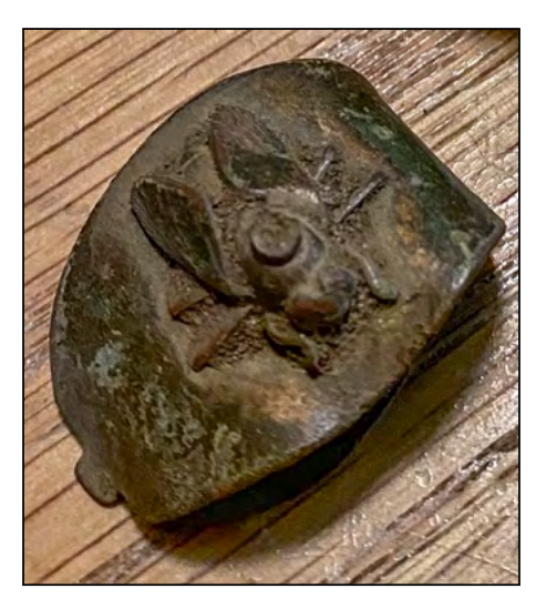
Finder:Kyle J., TexasUsing:ACE 300Find:Brass fly jewelry clasp