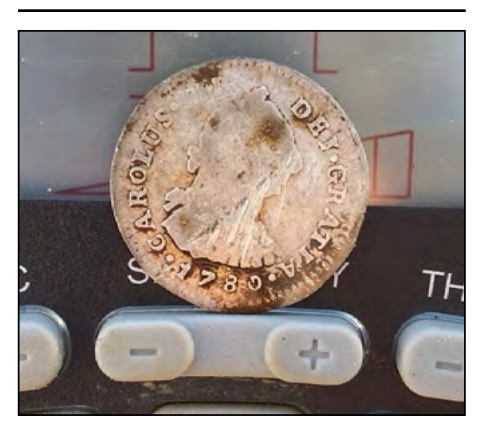
Finder: Wil C., New York Using: AT Gold Find: 1780 silver Spanish 1 reale