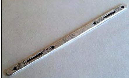
Finder: Amy H., Connecticut Using: AT Gold Find: Blunt bodkin for dress making with engraved "Lydia Pygen 1694"