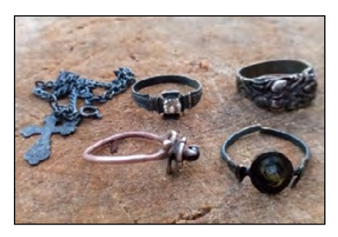
Finder: Alexei, Russia Using: AT Gold Find: Beach jewelry finds from the Leningrad region of Russia