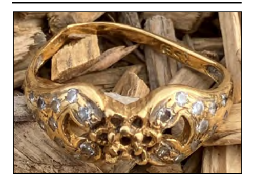
Finder:Jeffrey W., CanadaUsing:AT Pro InternationalFind:18k gold ring