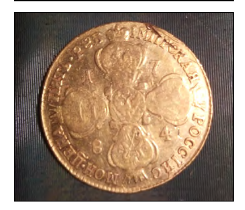
Finder: Roman A., Russia Using: ACE 250 Find: 1784 Empress Ekaterina II 5 Rubles gold coin