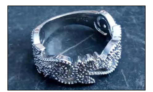
Finder:Kevin B., EuropeUsing:ACE ApexFind:.925 sterling silver ring