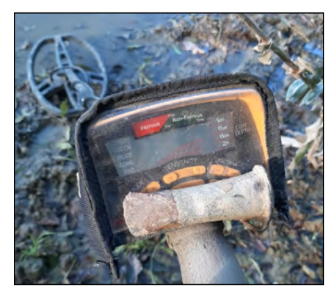
Finder: Mario M., Europe Using: EuroACE Find: Bronze Age socketed ax head, circa more than 3000 years old