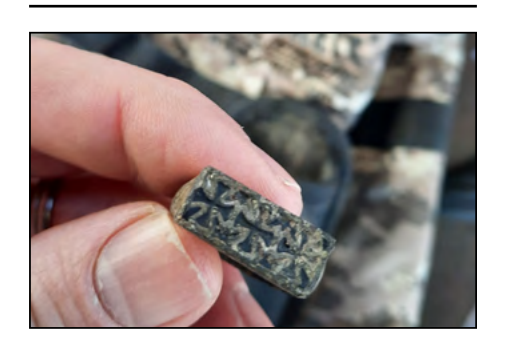
Finder:Ian R., AustraliaUsing:AT Max InternationalFind:German ring from WWII