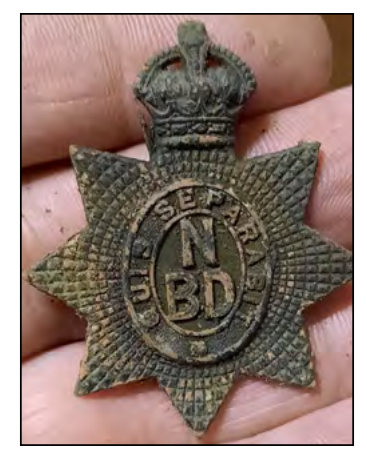
Finder: Ed T., Canada Using: AT Pro Find: 1911 New Brunswick 28th Dragoons cap badge