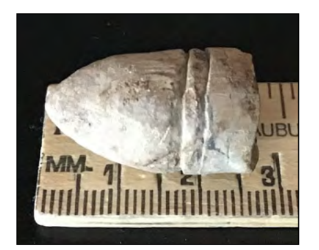
Finder:Clem B., MaineUsing:ACE ApexFind:Civil War bullet