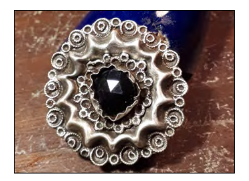
Finder:Mark H., EuropeUsing:AT Max InternationalFind:Silver brooch with stone