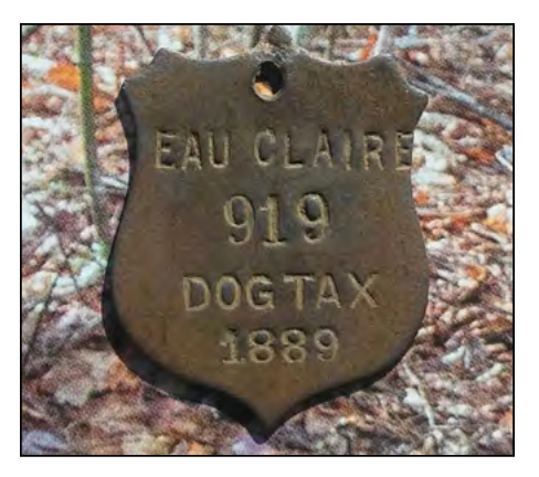
Finder: Tincup Tim, WisconsinUsing: AT ProFind: 1889 Eau Claire, WI dog tag