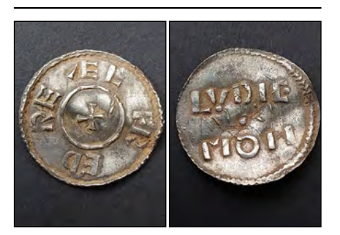
Finder: Rea C., Europe Using: AT Max International Find: King of Wessex: Alfred The Great silver penny, circa 871-899 AD