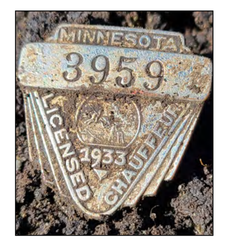
Finder: Dale K., Minnesota Using: AT Pro with Viper coil Find: 1933 Minnesota Chauffeurs license