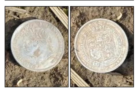
Finder:Tom S., EuropeUsing:AT Pro InternationalFind:1825 silver Sixpence