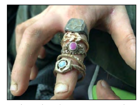
Finder:John L.'s son, New HampshireUsing:AT ProFind:Five rings in one day with theAT Pro