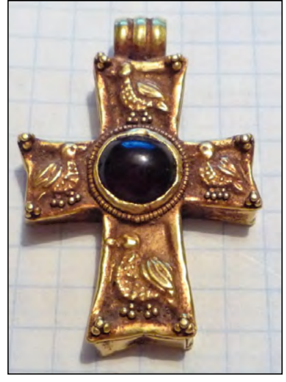
Finder: Roman Y., Europe Using: AT Max International Find: Golden Byzantine cross