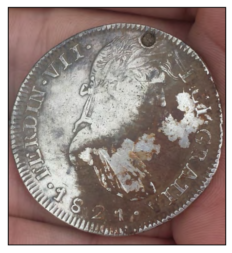
Finder: Ron B., Canada Using: AT Max Find: 1821 silver 8 reale discovered in a soccer field on its edge