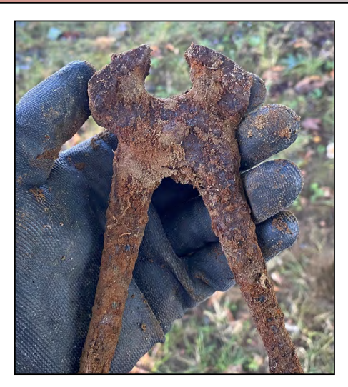
Finder:Brian C., MaineUsing:AT ProFind:Blacksmith's tool