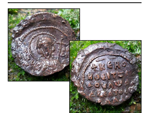
Finder: Fenin A., Europe Using: AT Pro International Find: Ancient hanging seal from the period of Kievan Rus, circa the 11th century.