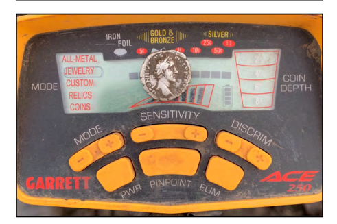
Finder: Oleksiy U., Europe Using: ACE 250 Find: Antoninus Pius Roman silver coin