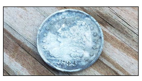
Finder: Monroe B., Missouri Using: AT Max Find: 1835 silver Capped Bust half dime