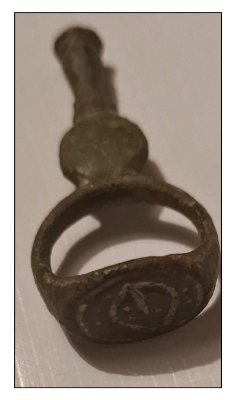
Finder: Craig K., Ireland Using: ACE 250 Find: Tudor seal ring and pipe tamper, circa 1500s