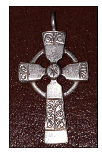
Finder: Dean W., Texas Using: AT Pro Find: Sterling silver Chi Rho cross pendant