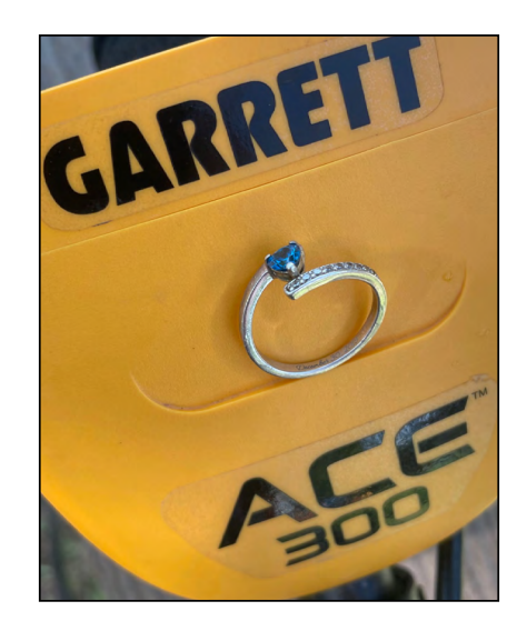
Finder: Joshua B., Using: ACE 300 Find: Sterling silver .925 ring with nine real diamonds and a large sapphire stone