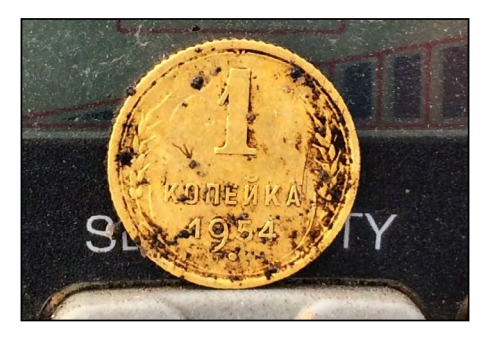
Finder:Pavel P., RussiaUsing:AT Pro InternationalFind:1954 Russian 1 kopek coin