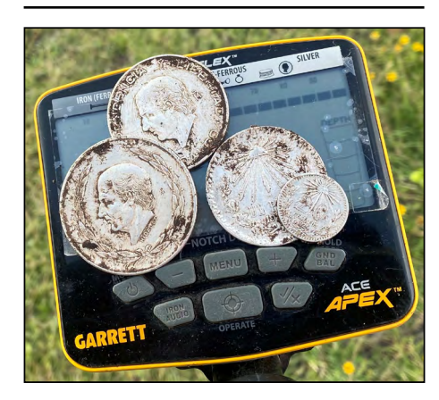
Finder: Jose N., Mexico Using: ACE Apex Find: Four silver coins discovered with the Apex