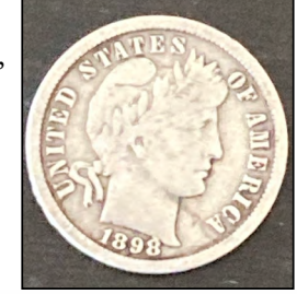
Finder: Eric K., Montana Using: AT Pro Find: 1898 silver Barber dime