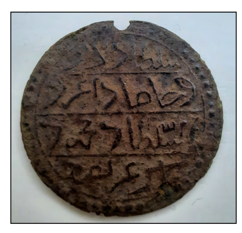
Finder:Annemiek S., EuropeUsing:AT Max InternationalFind:1800s Ottoman Empire coin