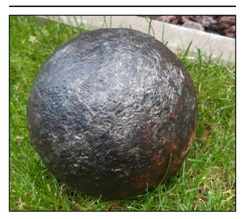
Finder: Bram V., Europe Using: AT Gold Find: Cannon ball, circa late 17th or early 18th century