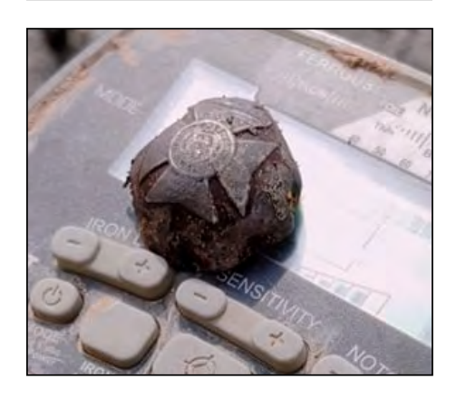
Finder:Ed T., CanadaUsing:AT Pro InternationalFind:Silver military cane topper