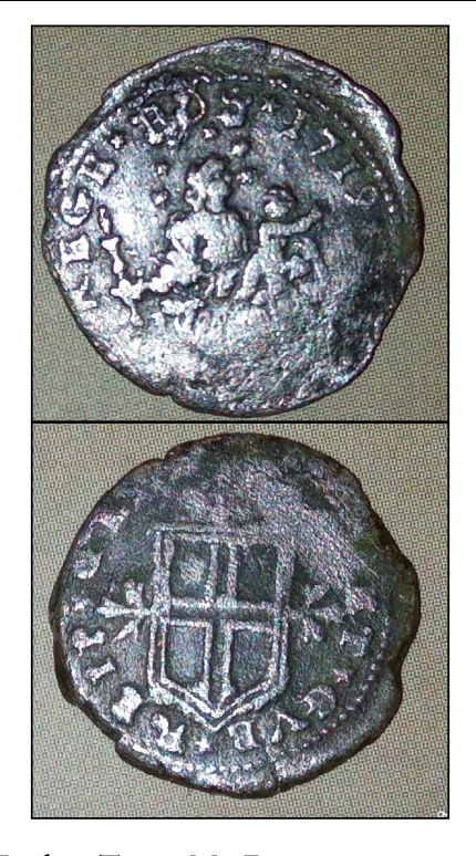
Finder: Tassan M., EuropeUsing: AT Pro InternationalFind: 1719 Republic of Genova silver8 reale