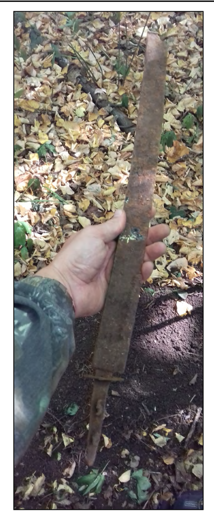
Finder: Mikhail N., Russia Using: ACE 250 Find: Broken sword with traces of gold ornaments, circa 9th - 11th century