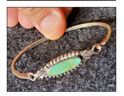
Finder: Kevin J., Colorado Using: ACE 350 Find: Sterling silver bracelet with turquoise stone