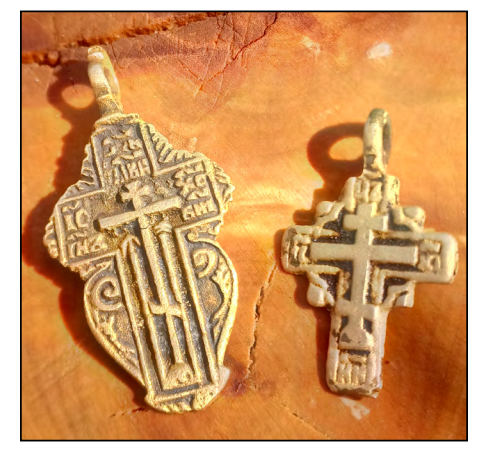
Finder:Alexei R., RussiaUsing:AT GoldFind:Antique gold crosses