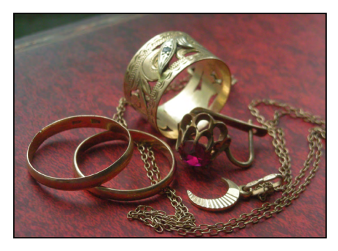
Finder:Alexey A., RussiaUsing:ACE 250Find:Gold jewelry