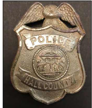
Finder: Cheryl C., Using: AT Pro International Find: Police badge from prohibition era donated to the police station