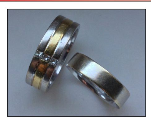
Finder: Rudy V., Europe Using: EuroACE Find: Two gold rings discovered feet apart in thick bushes.