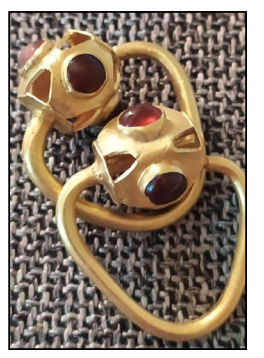
Finder: Anton Z., Russia Using: ACE 250 Find: Gold jewelry with garnets, circa 2nd or 3rd century BC